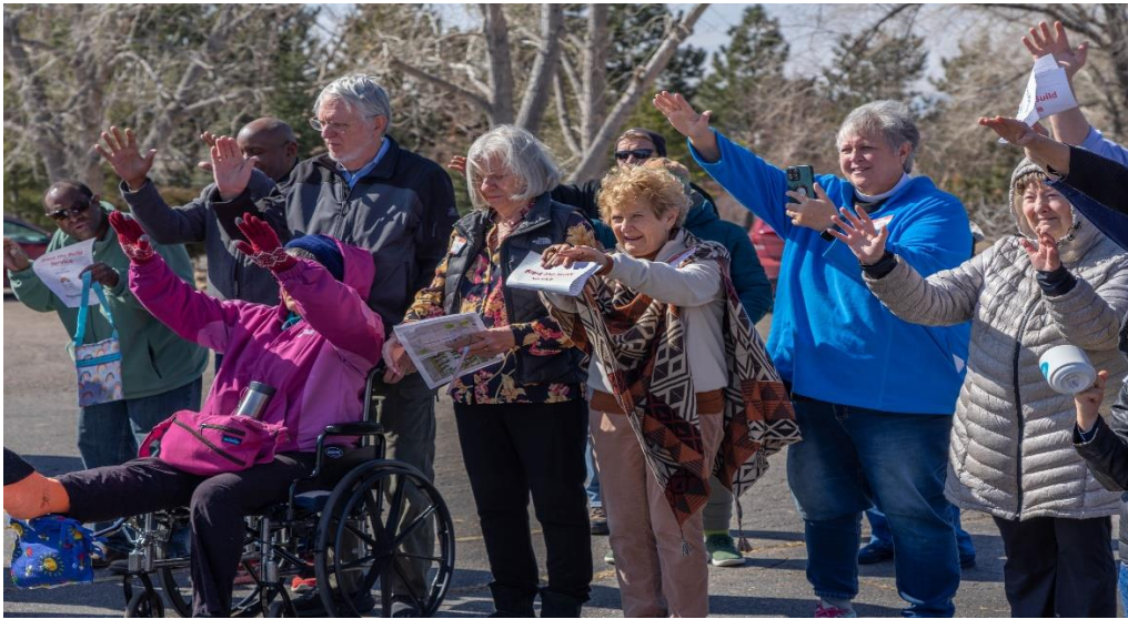
Bless The Build Celebration (March 2023)